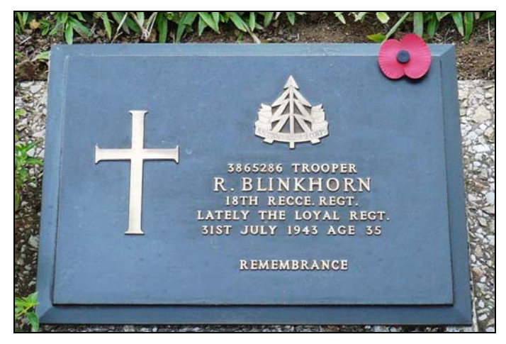
One of the 3627 images taken by Thet Mon in Thanbyuzayat . Each plaque has a poppy placed in the corner

As you plan your holidays for this year don't forget there may be locations around the world yet to be done, often in some quite exotic places like the Seychelles! If you are inclined to take a day off the sun bed then get in touch before you go.