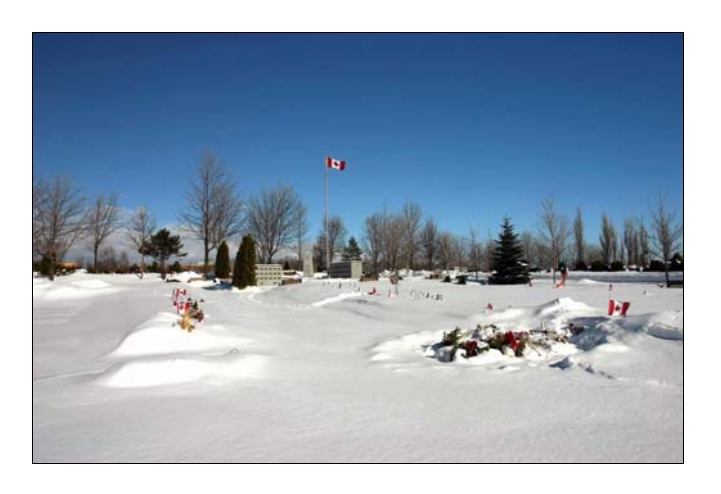
CANADA – Snow still stops play in Sudbury Civic Memorial Cemetery!

GAZA- At least 287 headstones were damaged, some shattered beyond repair, as the cemetery was hit by at least five shells during the recent conflict. It is believed at least one unexploded shell is still under the soil at the cemetery, meaning no visitors can be allowed until it has been dealt with.