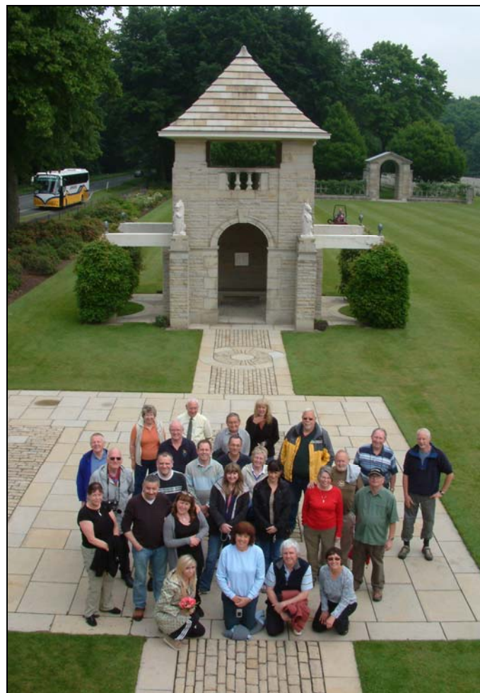
'TWGPP Team' at Reichswald war Cemetery, Germany

Enjoy your summer and keep the camera close at hand.