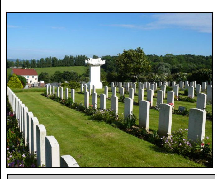
Cemetery at St. Etienne au Mort

I was intrigued to know why so many Chinese casualties were buried in CWGC graves so far away from home and in particular why almost all had died in the latter half of 1918 and even as late as December 1919. The answer was found on the CWGC website (www.cwgc.org/adminfiles/cwgc c/c.pdf).