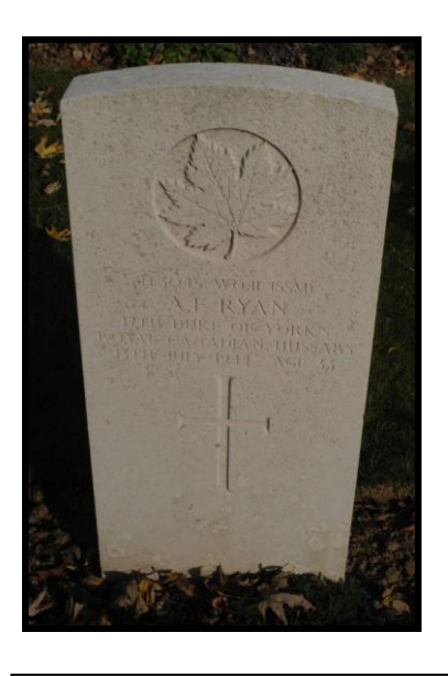
Original image and after a revisit

At present we await a new programme of re-engraving to co-ordinate this so that revisits are not wasted effort.